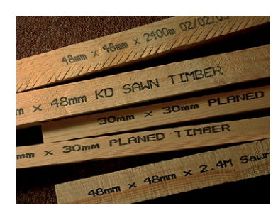
Direct applied to building materials