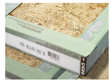
POS packaging for oversized items